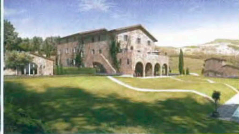
San Vittorino Estate in Umbria

Other available properties include a luxury villa, complete with motorboat, on the island of Capri, a hilltop house with panoramic terrace near Positano, and a partially restored property with ruins ripe for renovation near Ravello one of the few remaining examples of this type in the area. Prices start at €1.6m. Visit italianproperty.eu.com .